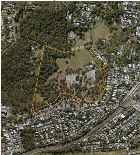
Map 1: PDA boundary

The PDA comprises approximately 19 hectares of land bordered by Cliveden Avenue to the north, bushland to the west, existing residential dwellings on Blackheath Road to the east and Seventeen Mile Rocks Road to the south. The boundaries of the PDA are shown on Map 1.