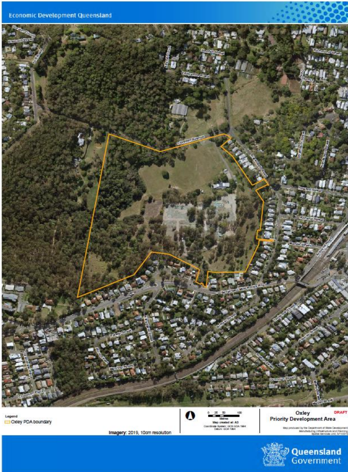
Map 1: PDA boundary