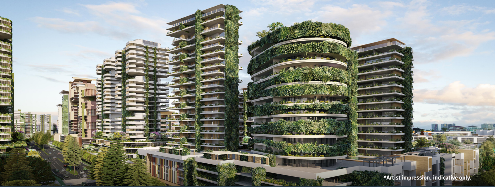
*Artist impression, indicative only.