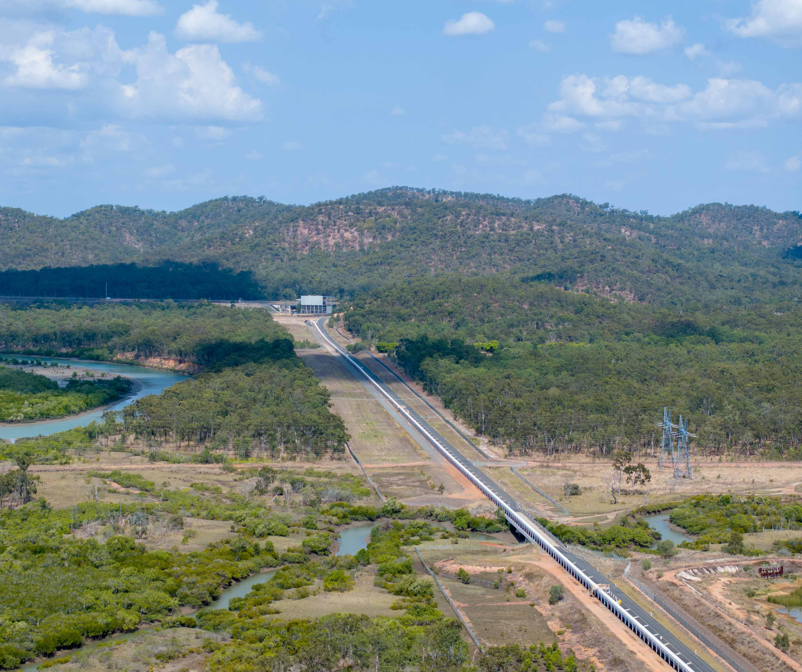
Gladstone State Development Area